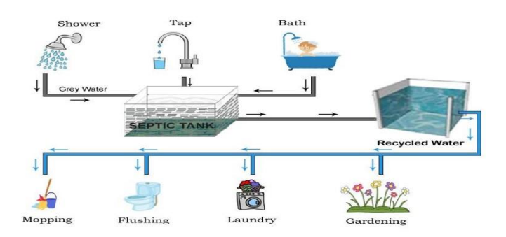
Figure 1: Greywater Recycling

GW treatment is the removal of unwanted suspended material from the greywater collected and disinfecting the same to make it useful for toilet flushing or irrigation or discharging to sewer lines according to the local laws applicable.