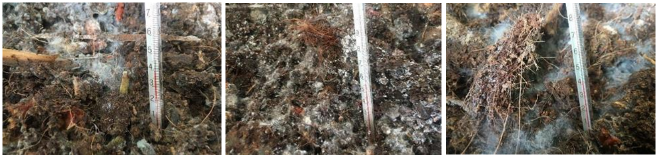
Figure 6: White Fungus during the Composting Process

Figure 6 shows that the white fungus produced during fermentation was noticeably different in appearance. The experimental boxes A1-3 were a spreading filament. While the experimental boxes B1-3 were granular and scattered in dots all over the fermentation box. Finally, the control boxes C1-3 have a spreading form of white fungus similar to experimental box A. It can be summarized that the fungus characteristics are related to the success and failure of digestion in the organic composting process.