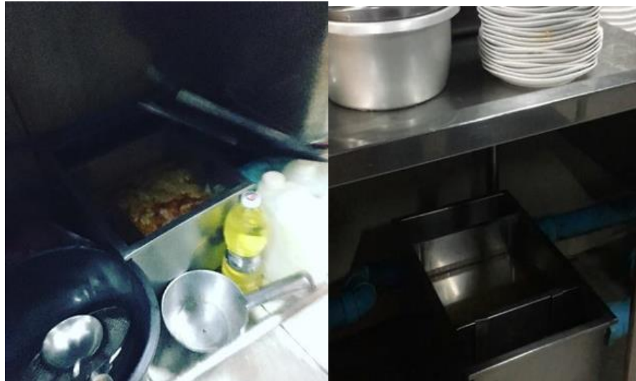
Figure 4: Grease Trap in Restaurants of Center One Superstore

From interviewing and observing wastewater management of food services, restaurants, and shops in Center One Superstore, it was discovered that grease traps were installed in every unit of the food services inside the superstore, including the dishwasher area of the food court zone, as shown in Figure 4.