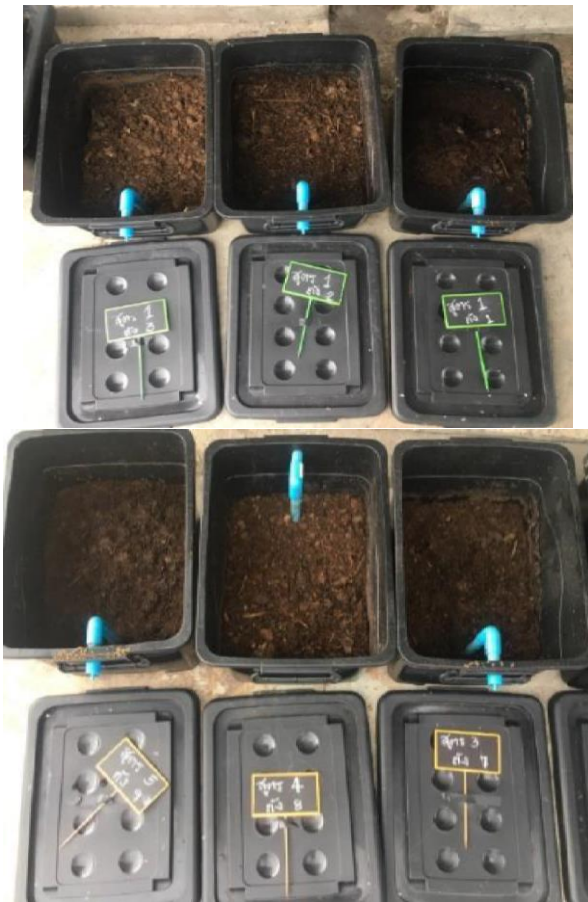
Figure 3: the Experimental Design for Composting the Organic Fertilizer.

This study also involved experimental research, divided into three sets: Experiment A, Experiment B, and Control C. Experiment A consisted of grease, food waste, cow dung, and coconut husk, while Experiment B included oil, food waste, cow dung, and coconut husk. The Control C set comprised only food waste, cow dung, and coconut husk. The co-composting proportion was 1:1:1 (food waste: cow dung: coconut husk). However, considering the literature's suggestions that an increase in grease and oil content (10%) could hinder composting, Experiment A and B sets introduced a ratio of 1-3 parts of grease and oil to co-compost with 1 part food waste, 1 part cow dung, and 1 part coconut husk, as depicted in Figure 3.